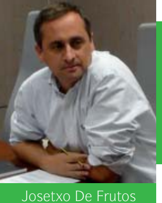
ULMA Handling Systems – (JDF)